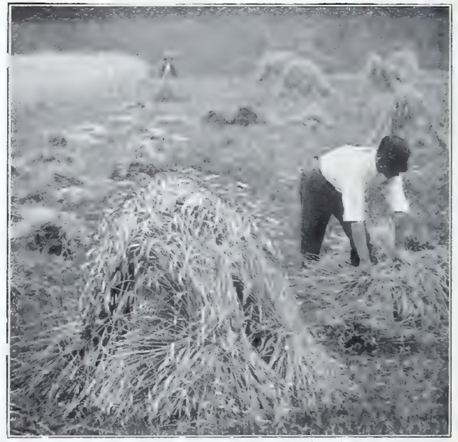
Harvesting a Field of Oderbrucker Barley

For illustrations and descriptions of varieties of Winter Wheat see "Henderson's Fall Wheat Circular" issued in July. We offer the leading varieties. We can also take orders now for delivery from the harvest of 1940 at prices ruling at time of shipment.